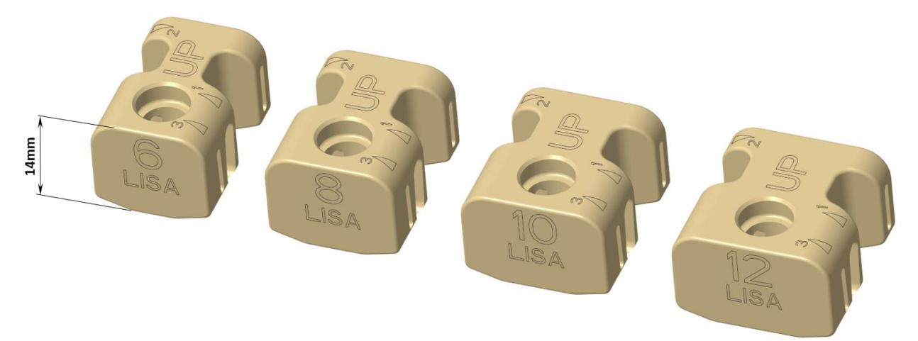
Figure 3.1-1 : Image of LISA spacer which is available in four sizes